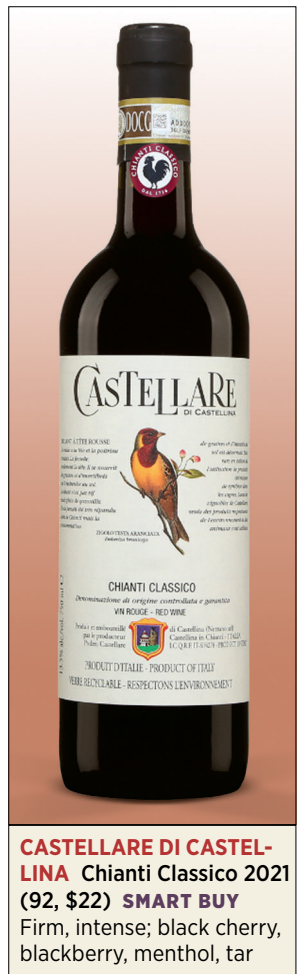
CASTELLARE DI CASTELLINA Chianti Classico 2021 (92, $22) SMART BUY Firm, intense; black cherry, blackberry, menthol, tar